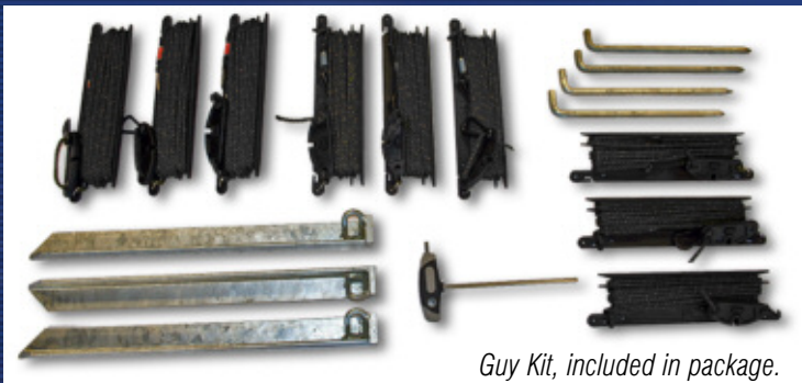
Guy Kit, included in package.

The PFC series of the telescopic masts have a base section diameter of 85.6mm and are operated by hand. The mast sections are made of a fibreglass/carbon fibre sandwich that gives a very lightweight, durable mast. Each section has a locking collar and dampening valves that control the speed at which the mast is lowered. The mast is designed for portable applications such as mobile radio communications.