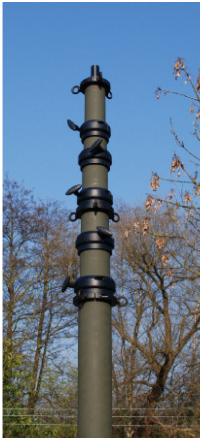
Guying and Positioning