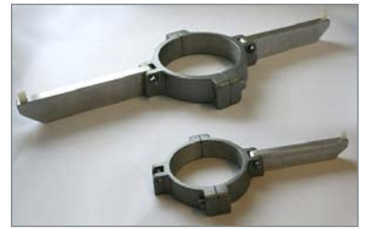
Single Step NSP/152/1 Double Step NSP/152/2

Climbing Steps These are useful for field applications, providing easy access to locking collars and antennas. They clamp in any position on the mast lower section and fold upright for transit. Single steps for climbing. Double steps for resting.